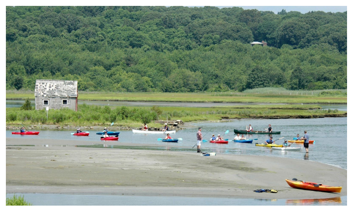
Some of the many kayakers in the 2011 Pettaquamscutt Paddle navigate between the Sedge Island and a sand bar.